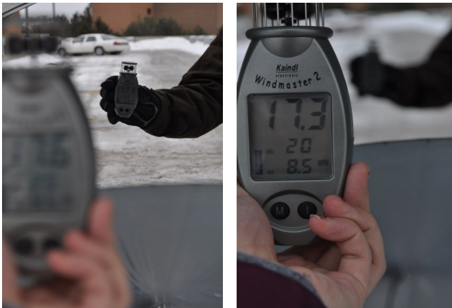
Figure 2. Wind Data Collection

The current study consisted of a set of procedures that would test and analyze a wind turbine attachment to assess the performance of an experimental wind turbine at different wind velocities. A customized wind tunnel attachment was transported to a highly elevated field for the experiment. Construction was contracted to an outside vendor with the specification that the inlet section (larger diameter) be 1.45 times larger than the tube (smaller diameter). Additionally, the inlet section was constructed at a 30-degree angle from the horizontal surface of the tube. This angled section was not tested to compare how different angles would behave in terms of wind flow rate. Two anemometers were placed in order to measure the wind velocities at the inlet and outlet sections of the WTA (see Figure 2).