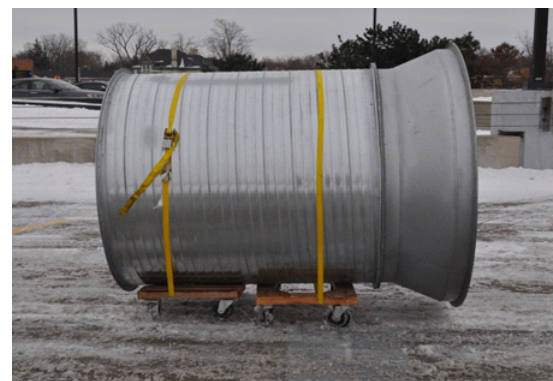
Figure 1. Wind Tunnel Attachment (WTA)